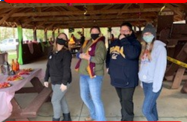
Harry Potter Night hosted by the Spies Public Library